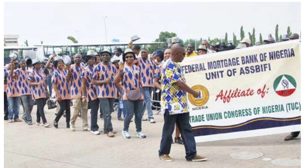
NIGERIA: Bank workers, part of the Trade Union Congress of Nigeria contingent, march through Abuja's Eagle Square