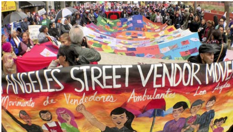
USA: Street vendors in Los Angeles join thousands of unions, faith communities and immigrants' rights groups to march against President Donald Trump's harsh anti-immigrant policies