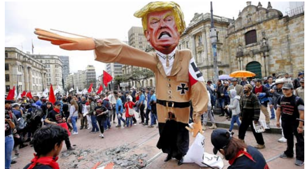
COLOMBIA: May Day protesters prepare to set alight an effigy of US President Donald Trump dressed as a Nazi officer in the capital, Bogotá