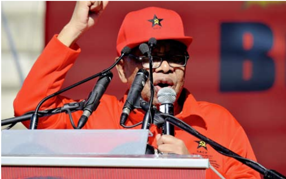
SACP General Secretary Blade Nzimande addresses Cosatu's Mandela Bay May Day rally

Once the national minimum wage becomes law, it is an important responsibility of all unions to USE this floor as a weapon to organise the most vulnerable – including in sectors where there are sectoral settlements of R17 or less than R20 per hour.