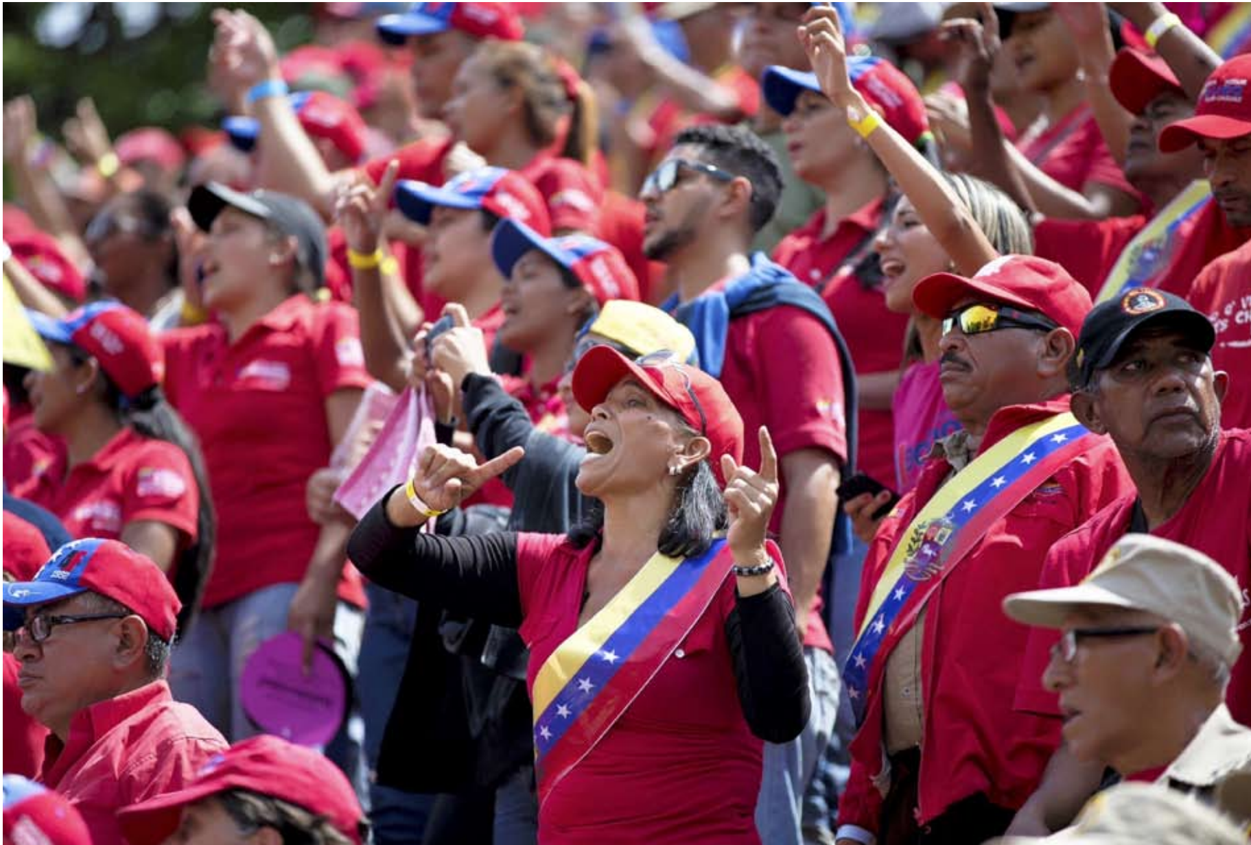
VENEZUELA: Cheering President Nicolas Maduro at a massive May Day rally in Caracas. Maduro, a former bus driver, then in the midst of an election campaign, had just announced an increase in the minimum wage – the third this year – to offset the impact of rampant inflation resulting from US sanctions against Venezuela