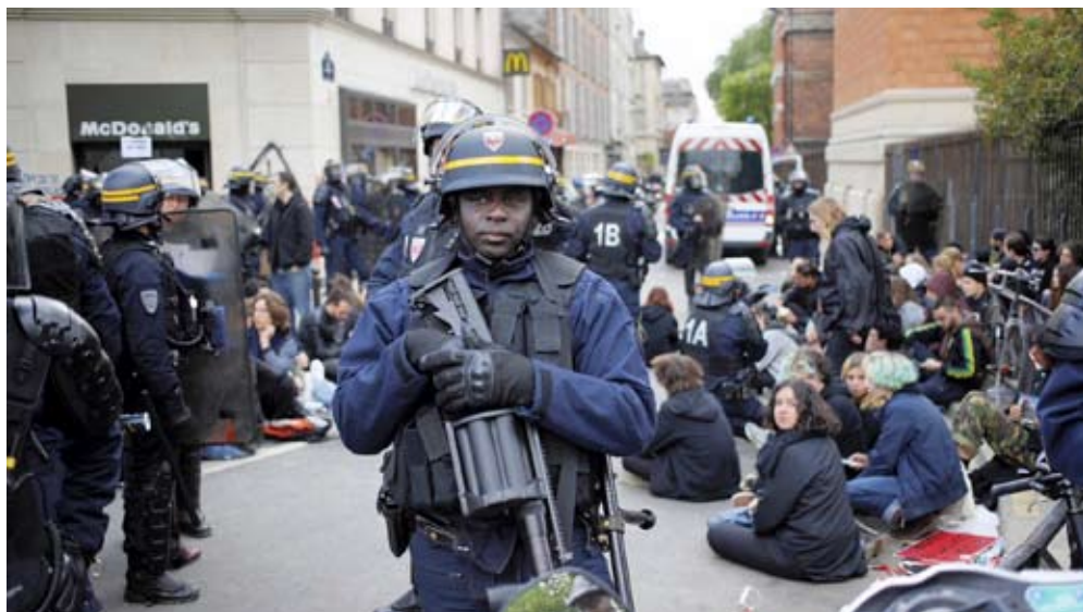
FRANCE: Police detain protesters after about 1 000 masked anarchist protesters joined the traditional May Day march through Paris - then smashed a McDonald's outlet and set fire to cars and shops