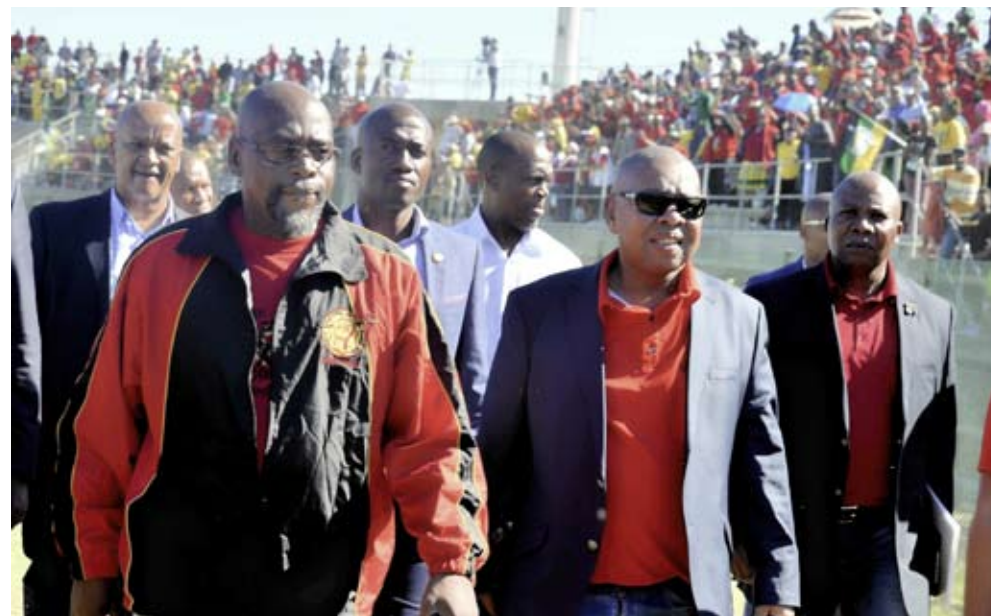
Cosatu President Sdumo Dlamini and SACP General Secretary Blade Nzimande arrive at Cosatu's Mandela Bay May Day rally

The struggle against State Capture is not just a general moral struggle against crime and corruption. As important as that is. It is directly a working class struggle, because State Capture is a direct threat to jobs and to the well-being of workers and the poor in our country. It is State Capture that has drained our budgetary resources. It is state looters and Tom Moyane's perversion of SARS that has led to revenue under-performance. And so we have had an increase in VAT. It is a wrong intervention. We agree with Cosatu that VAT increases are a blow against workers and poor. The SACP calls for a wealth tax on the super-rich, and for a land tax on unoccupied land, and on property speculators. We say no to regressive taxes. We say no to the VAT increase.