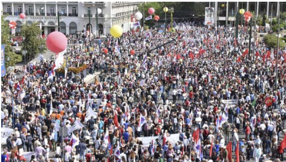
GREECE: Workers from the PAME union federation food central Athens, protesting "imperialist intervention in Syria" and expressing solidarity with the workers of Turkey and the people of Palestine