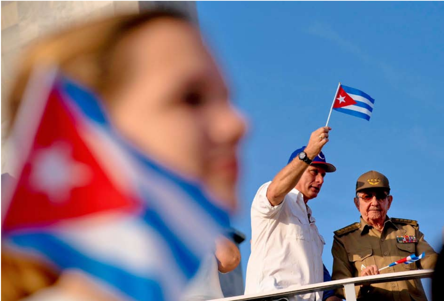
CUBA: New Cuban President Miguel Diaz-Canel (left) and his predecessor Raul Castro greet hundreds of thousands of supporters marching under the slogan "United in our socialism" at Cuba's main May Day rally in Havana. Castro, who retired as president in April, remains head of the Communist Party of Cuba