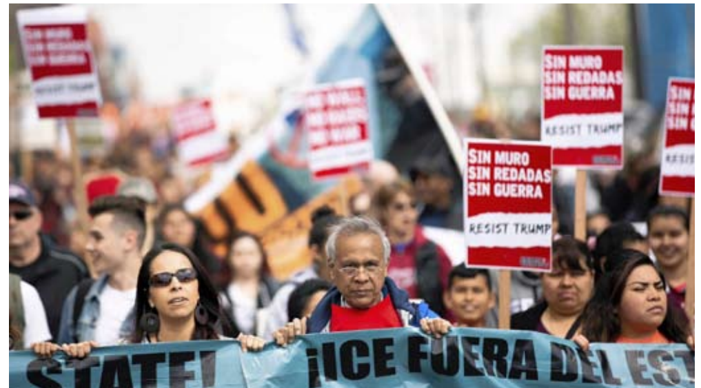
USA: Marching through the Seattle CBD to protest the Trump administration's anti-immigrant and anti-union policies