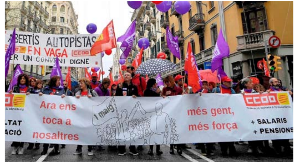
SPAIN: May Day marchers in Barcelona demanding gender equality and opposing government austerity measures which have slashed unemployment benefits