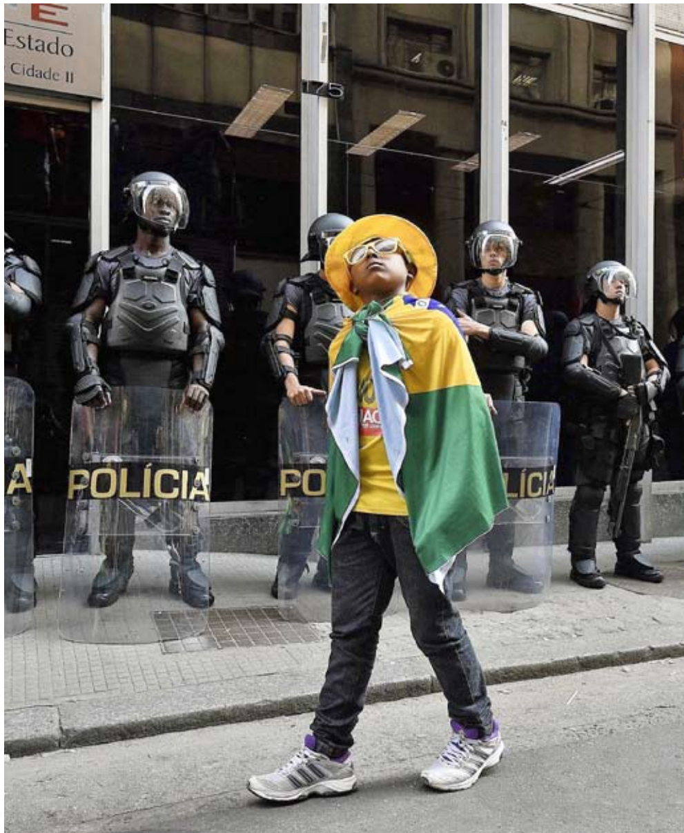
BRAZIL: A young flag-cloaked Brazilian on his way to the May Day march in Sao Paulo