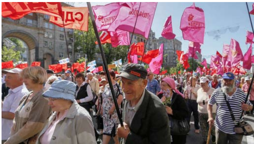
UKRAINE: Unionists and supporters of the country's left-wing parties march through central Kiev to mark May Day