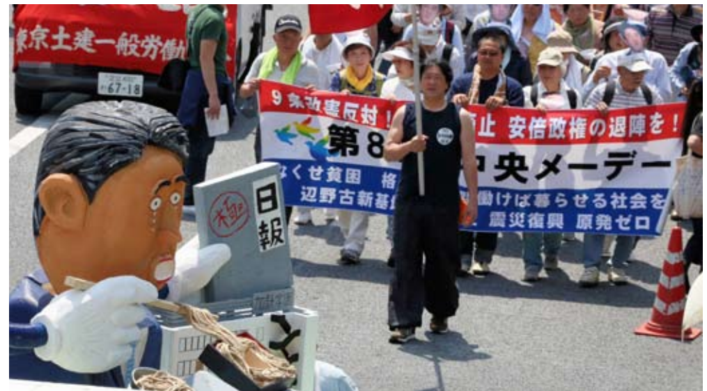
JAPAN: Led by a caricature of Prime Minister Shinzo Abe, workers march through Tokyo demanding better working conditions - and Abe's resignation