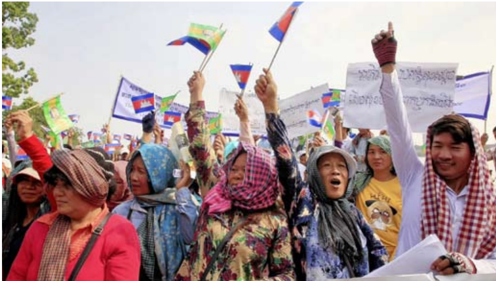
CAMBODIA: Cambodian textile workers demanding permanent employment contracts and better working conditions at the Tonle Sap river bank in Phnom Penh