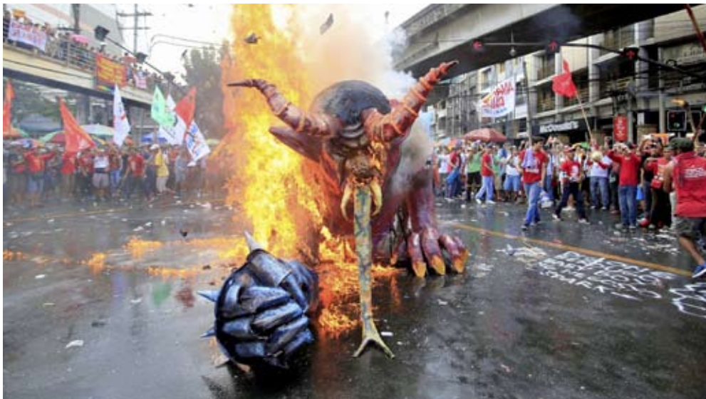
PHILIPPINES: Protesters in Manila burn a caricature of a dragon with President Duterte's face on their May Day march. They demanded that he stick to election promises to re-introduce employment benefits