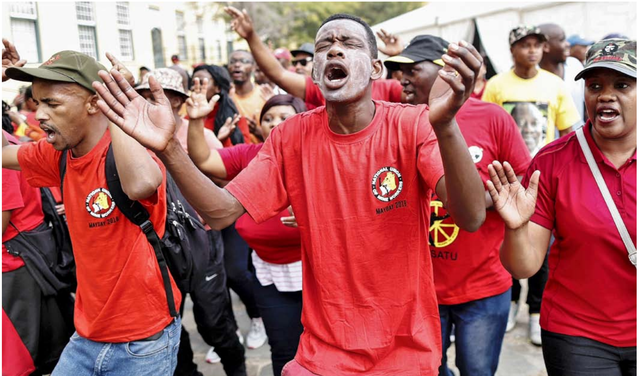
Cosatu May Day marchers toyi-toyi in Cape Town