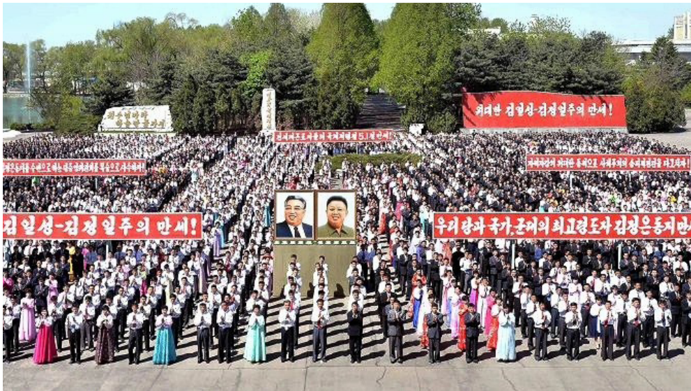
KOREA: In North Korea (left), thousands of workers celebrate May Day outside the Rungrado 1st of May Stadium in Pyongyang, while in the south (right), about 30 000 workers in Seoul hold a rally demanding better working conditions