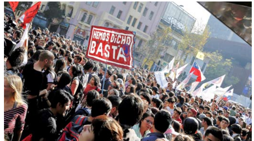
CHILE: Students protest in Santiago against the privatisation of tertiary education, threatened by incoming conservative President Sebastian Pinera