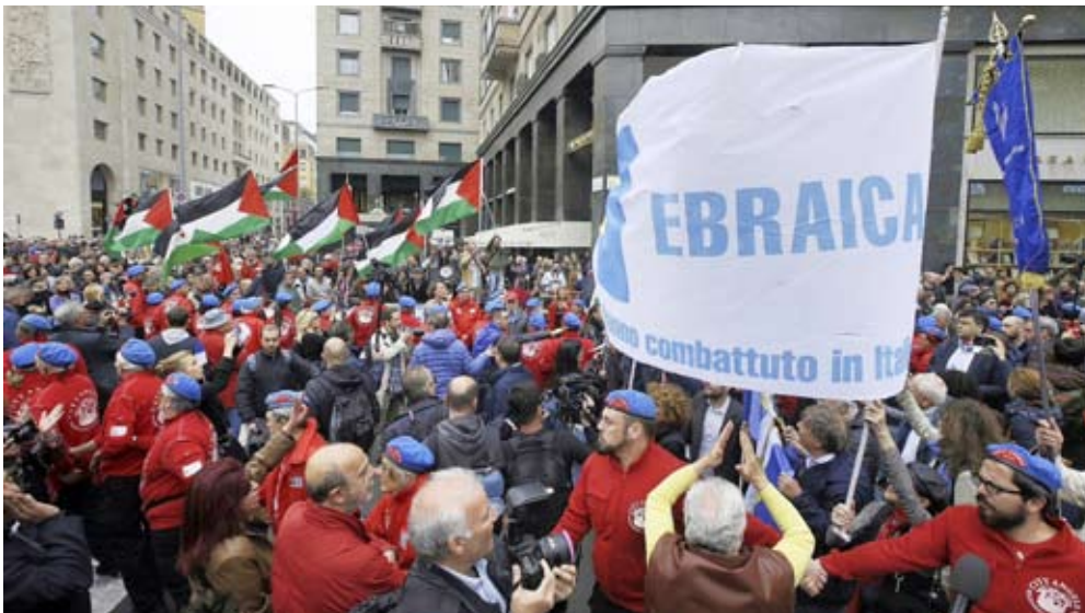
ITALY: Zionist supporters (in blue berets and red jackets) block a march in Rome in support of Palestinians' "March of Return" protests