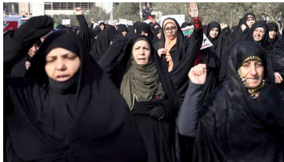
IRAN: Marchers in Tehran march on May Day to protest USA threats to impose sanctions on Iran, following Donald Trump's unilateral scrapping of Washington's nuclear deal with Iran