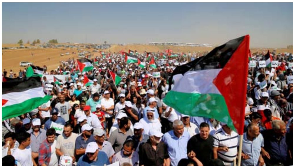
PALESTINE: Israeli Arabs march in support of the Palestinian "March of Return", a protest marking the 70th anniversary of the Nakba (catastrophe), when Zionist forces expelled 750 000 Palestinians