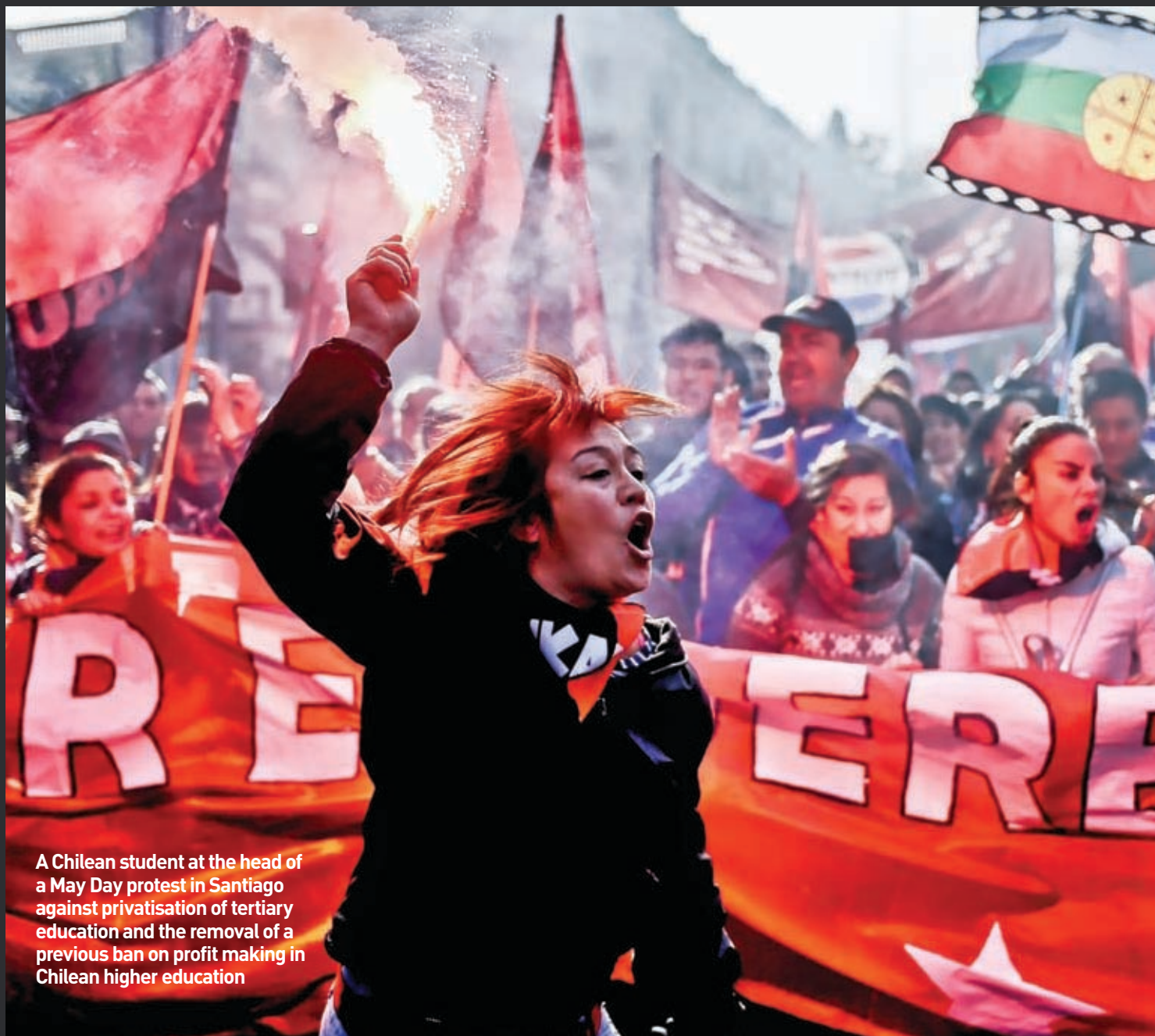
A Chilean student at the head of a May Day protest in Santiago against privatisation of tertiary education and the removal of a previous ban on profit making in Chilean higher education