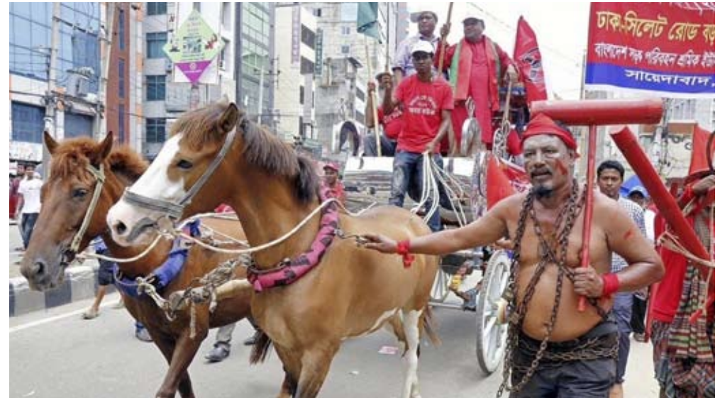
BANGLADESH: A marcher wears chains to demonstrate his exploitation in a May Day march through Dhaka, demanding an increase in the minimum wage and improved working safety