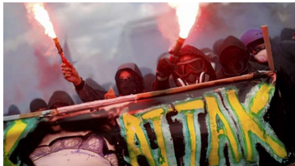
FRANCE: Anarchist protesters join the traditional May Day march on the 50th anniversary of 1968 protests that triggered a general strike throughout France