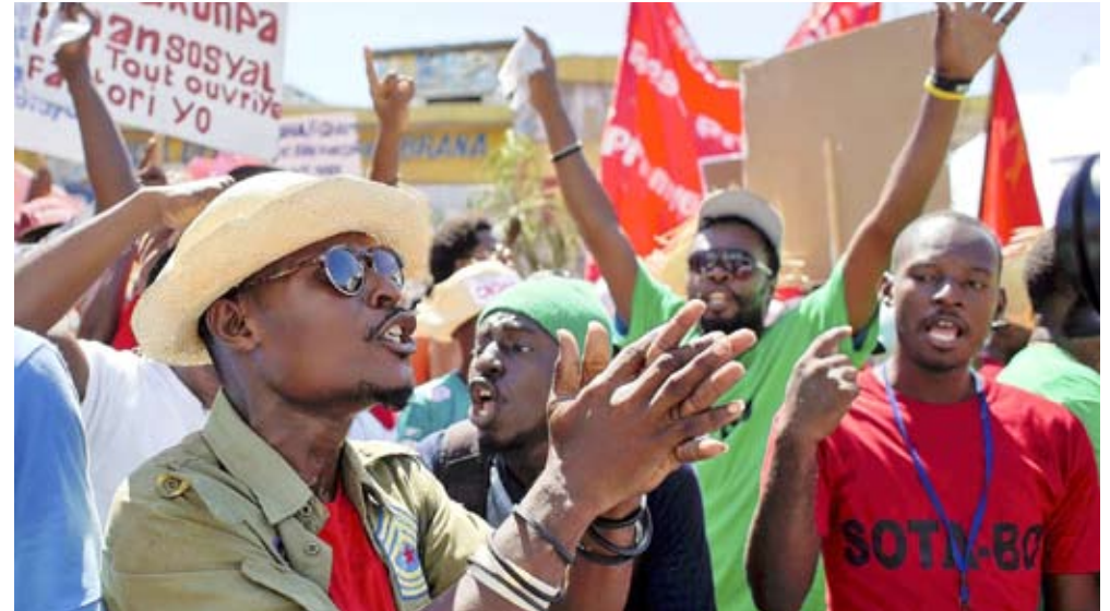
HAITI: Workers in Port-au-Prince chant slogans critical of President Jovenel Moïse's government