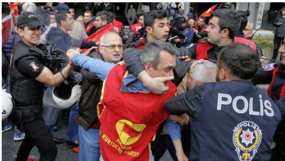
TURKEY: Police arrest demonstrators attempting to reach Taksim Square, traditional venue for May Day gatherings in Istanbul