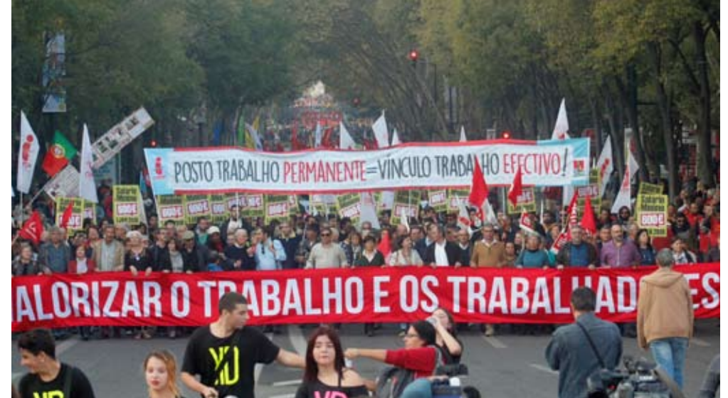
PORTUGAL: Members of Portugal's CGTP union federation demand an end to new labour laws