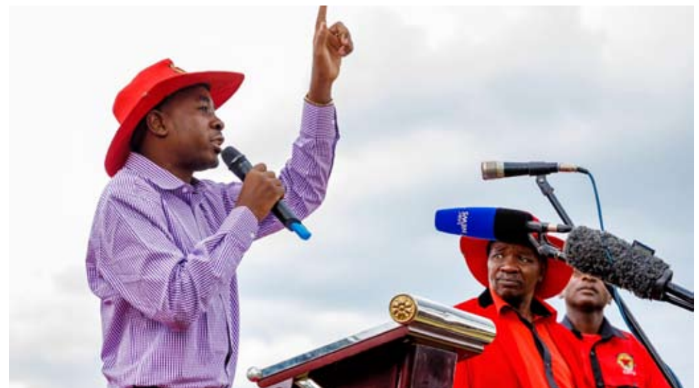
ZIMBABWE: Leader of the opposition MDC (T), Nelson Chamisa, addresses a Zimbabwe Congress of Trade Unions May Day rally at Dzivarasekwa Stadium, Harare