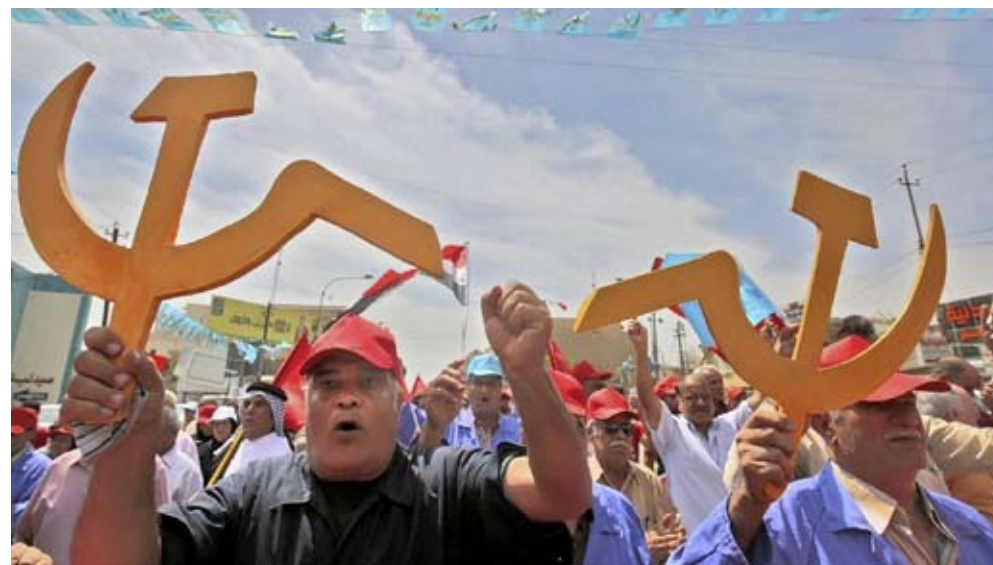
Iraqi Communist Party members march in Baghdad. The party is part of the Sairoun Alliance, the biggest grouping in Iraq's parliament