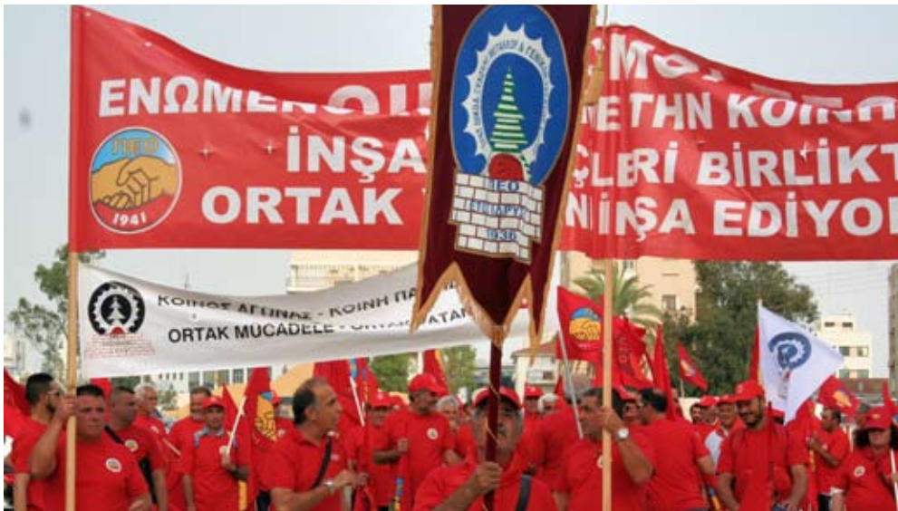
CYPRUS: Workers and members of the communist AKEL party prepare to march to protest neoliberal policies that are making Cyprus the most socially unequal country in the EU