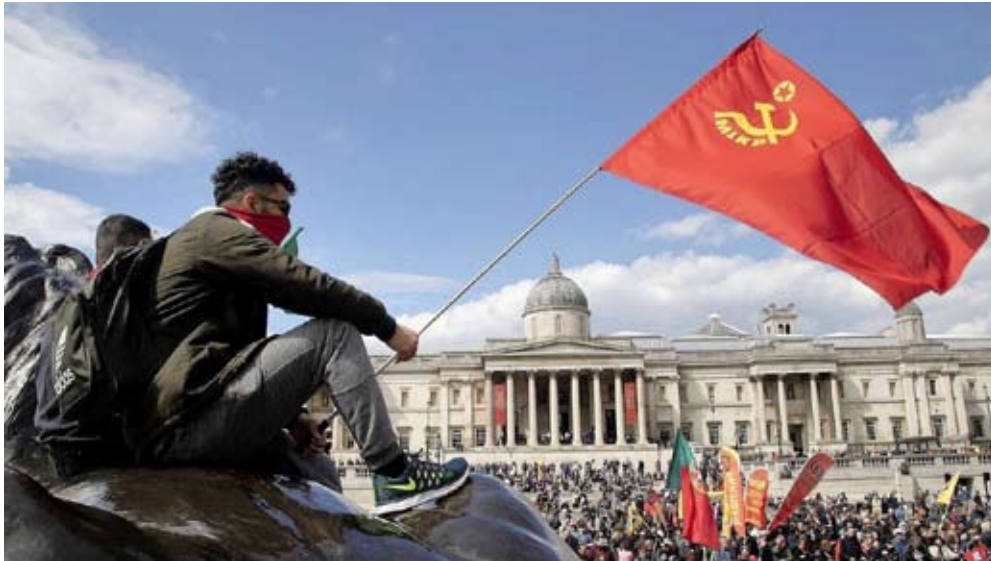
BRITAIN: Thousands of marchers gather in London's Trafalgar Square, with a focus on the racist and anti-immigrant policies of Theresa May's government