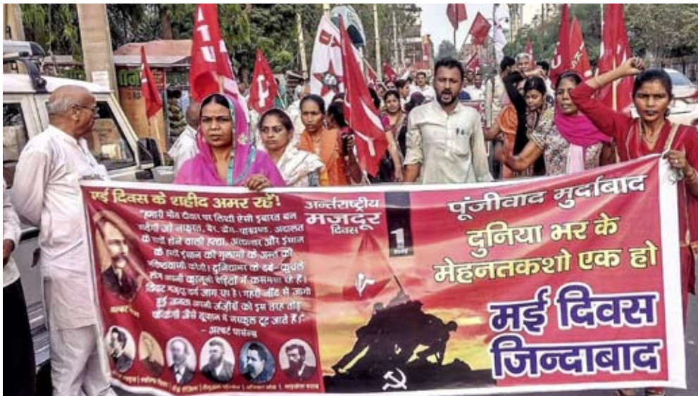
INDIA: Trade union members and communists march through Bangalore, capital of Karnataka state, on May Day